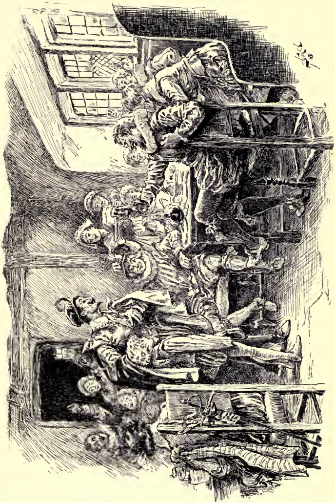
“Master Nicholas Skylark. The sweetest singer in all the kingdom of England!”